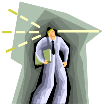
Project Proponent / Exporter (Borrower)