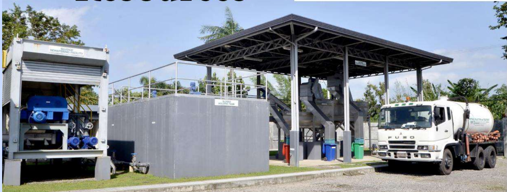
Photo shows Environkonsult's sludge dewatering facility, sludge holding tank, septage receiving facility, and desludging truck.