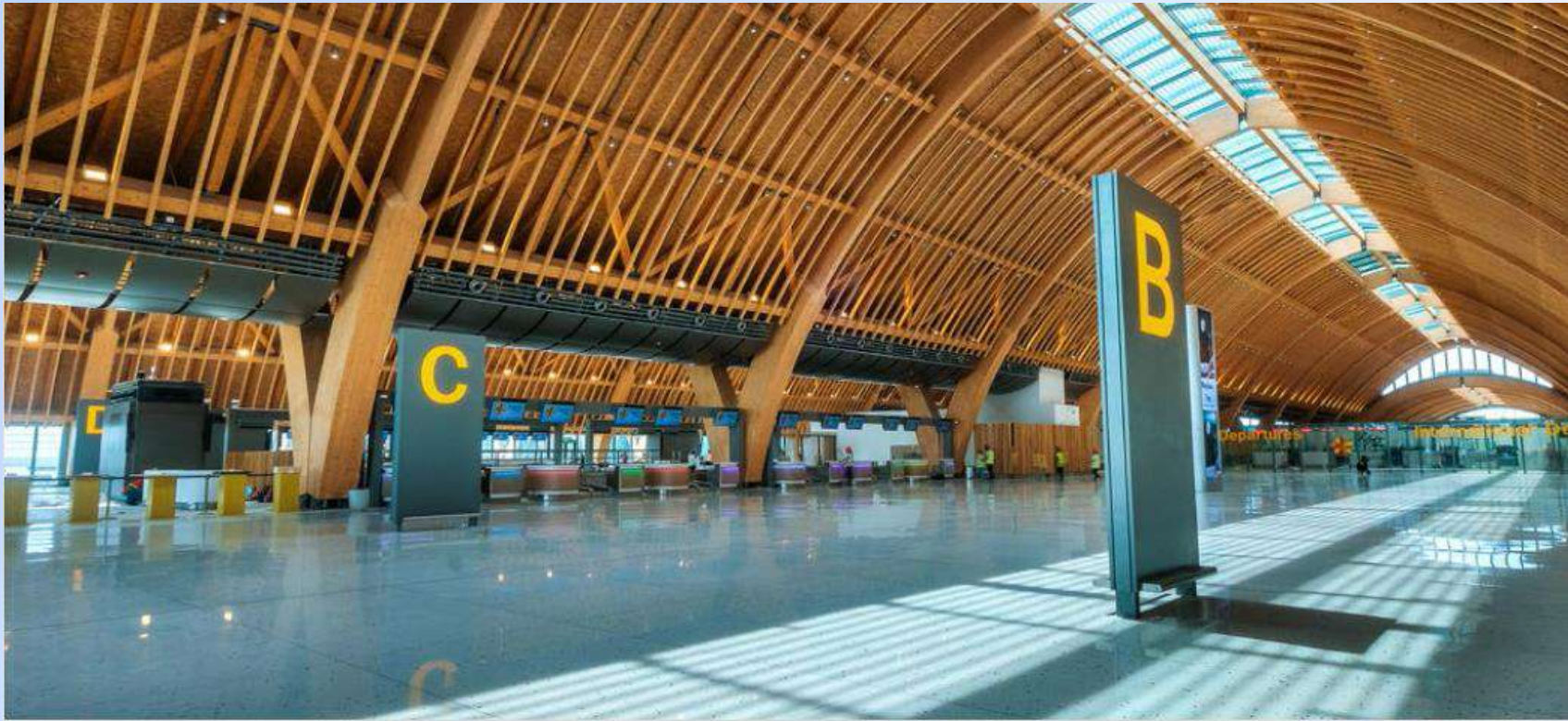
The new Mactan-Cebu International Airport (MCIA) terminal will increase the passenger capacity of MCIA to around 12.5 million.